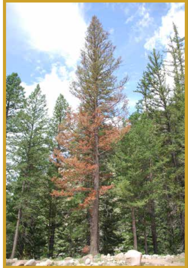
Figure 1. A tree killed by Douglas-fir beetle.

In Colorado, outbreaks typically occur in the southern part of the state, especially in portions of the Rampart Range, Wet Mountains, Sangre de Cristo/Culebra ranges, La Garita Range, West Elk and Elk mountains, and the southern slopes of the San Juan Mountains.