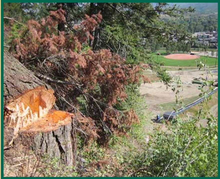
Figure 15. Beetle-killed trees can be hazardous, especially in recreation areas or places that people frequent, and often need to be removed.

Colorado's forests provide clean air and water, wildlife habitat, world-class recreational opportunities, wood products and unparalleled scenery. These benefits contribute to quality of life and are vital to state and local economies. Without careful management of forest resources, these assets and community safety are at risk. It is critical to proactively manage forests, and for landowners and communities to remain informed about related threats, to ensure healthy, resilient forests for present and future generations.