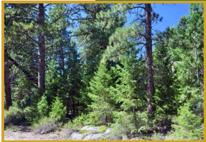
Figure 16. Douglas-fir trees are often a component of larger mixed-conifer forests.