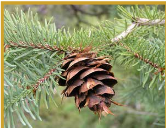
Figure 2. Douglas-fir tree cones are characterized by three-pronged "tails" jutting from between the scales.

This Quick Guide was produced by the Colorado State Forest Service to promote knowledge transfer.