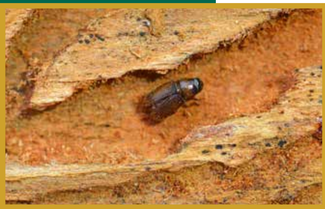
Figure 4. An adult Douglas-fir beetle.